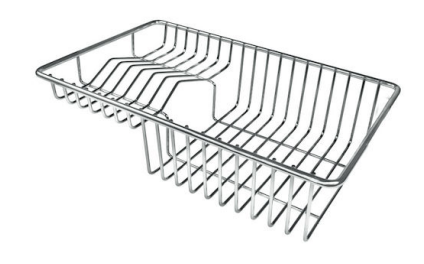
8100 303 * only in combination with the accessory 8644 101