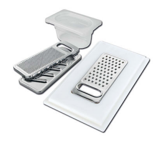
food collection tray 8159 101