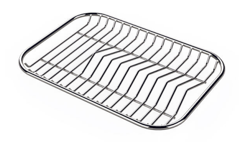
Stainless steel plate rack 8100 154